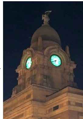
Lake County Courthouse

The majestic Lake County Courthouse Clock, Cleveland's iconic Terminal Tower, many porches, offices and entryways will be lit green in Lake County. Also joining in this year are Laketrans