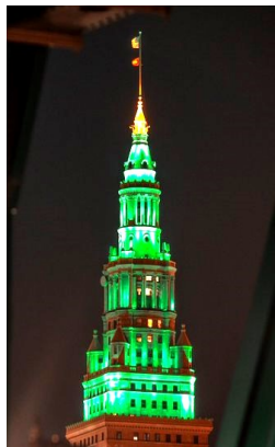
Cleveland Terminal Tower